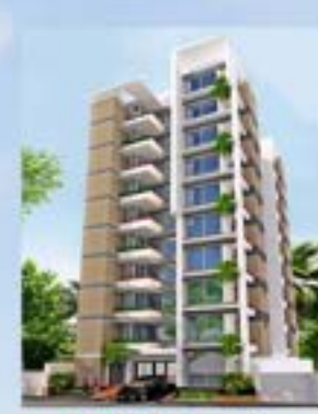
ANZ - Paradise at Bashundhara