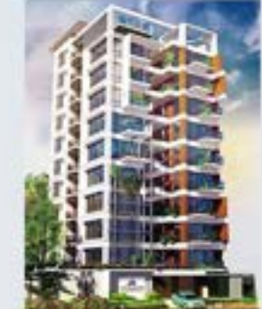
ANZ-South face at Bashundhara