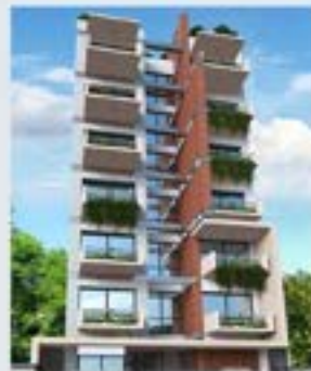
ANZ-Aftabnagar 3 katha at Aftabnagar