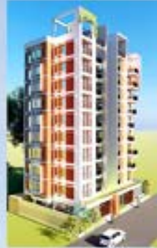
ANZ-Engineers Lodge at Bashundhara