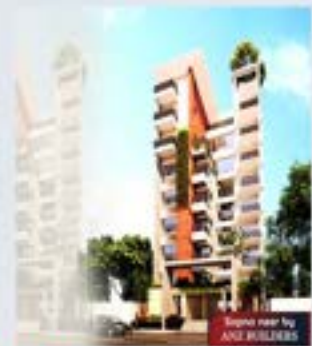
ANZ - Sopno Neer at Bashundhara Baridhara