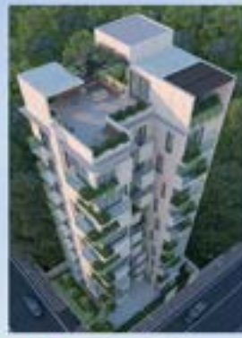
ANZ-Amity Villa at Bashundhara