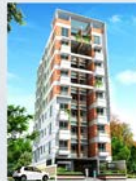
ANZ- Lake Park View at Bashundhara