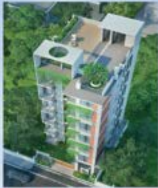
ANZ - Florence Villa at Bashundhara