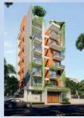
ANZ - Cherry Blossom at Bashundhara