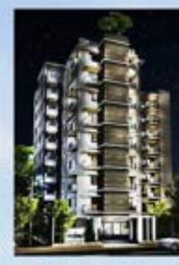
ANZ-Luxury Palace at Bashundhara