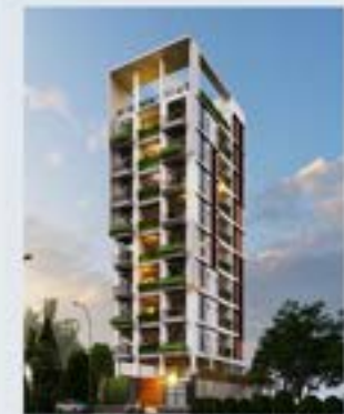
ANZ-Orchid Villa at Jolshiri