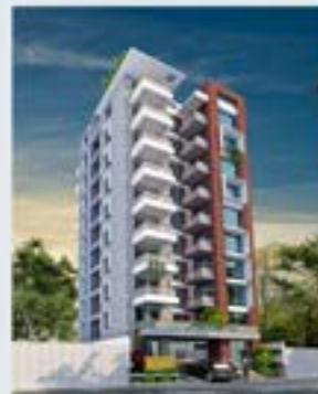
ANZ-Riverview at Bashundhara