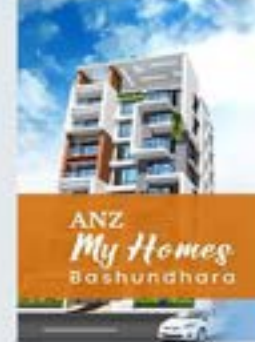
ANZ-My Home at Basundhara