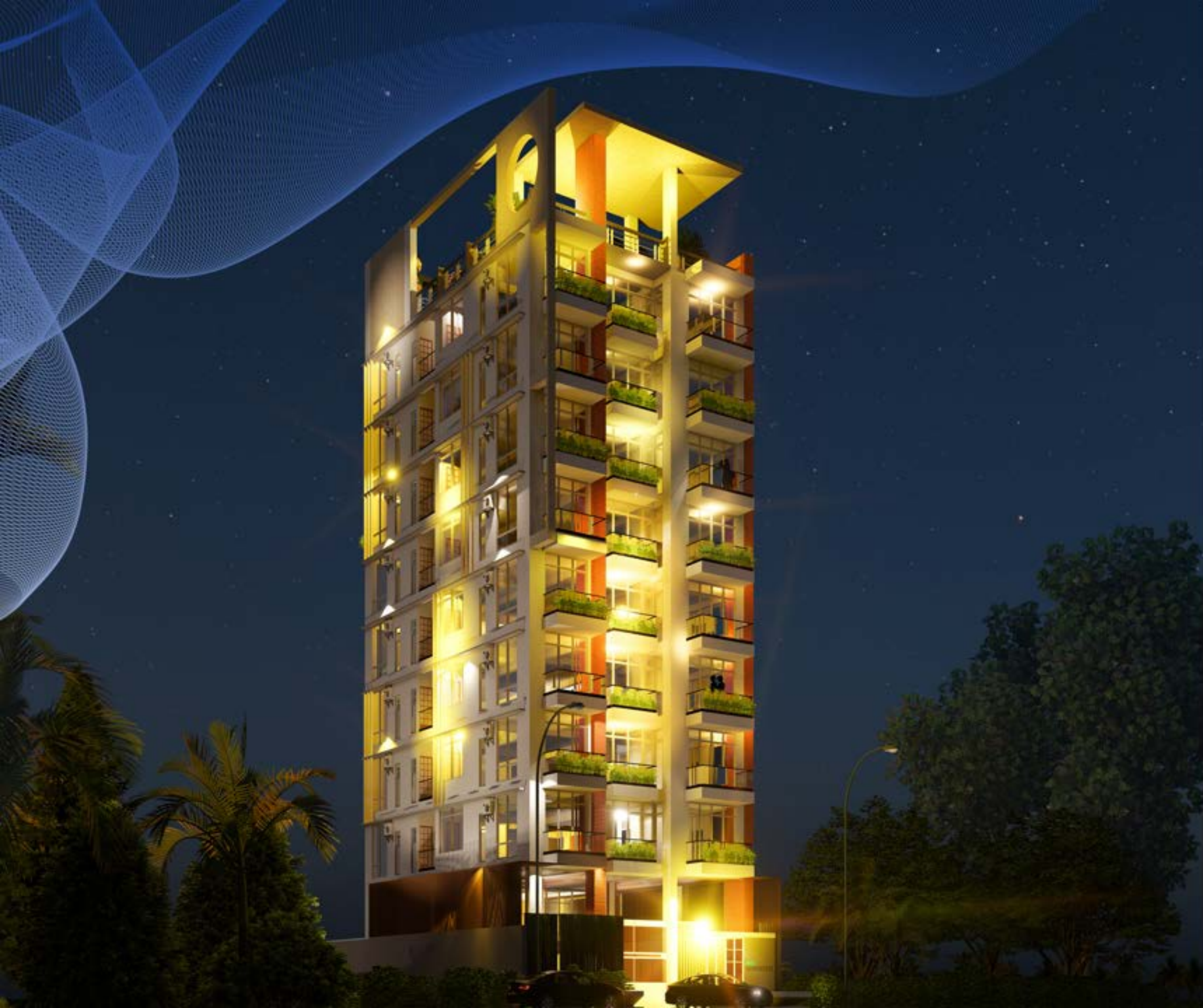
Night view of ANZ SHARITA