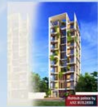
ANZ - Mahbub Palace at Bashundhara Riverview