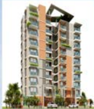
ANZ - Shouhardo at Bashundhara