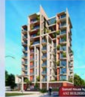
ANZ - Samad House at Bashundhara Riverview