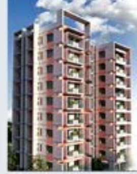
ANZ- Lake View at Bashundhara