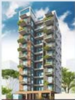
ANZ-Aftabnagar 5 katha at Aftabnagar