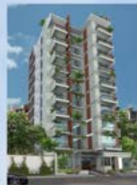
ANZ - Southern Park at Bashundhara