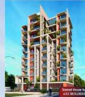
ANZ - Samad House at Bashundhara Riverview