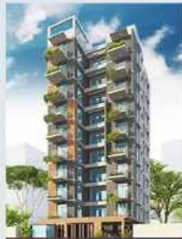
ANZ-Hasnahena at Aftabnagar