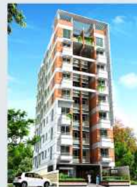
ANZ- Lake Park View at Bashundhara