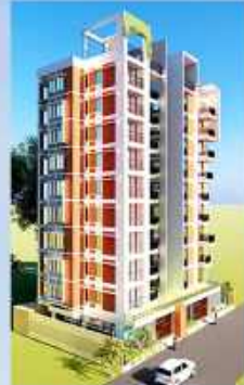
ANZ-Engineers Lodge at Bashundhara