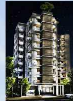
ANZ-Luxury Palace at Bashundhara