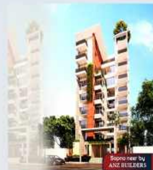
ANZ - Sopno Neer at Bashundhara Baridhara