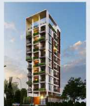
ANZ-Orchid Villa at Jolshiri