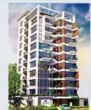
ANZ-Sunflower at Bashundhara