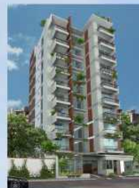
ANZ - Southern Park at Bashundhara