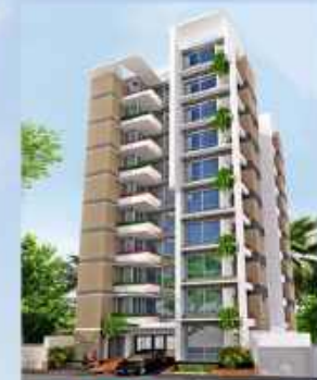
ANZ - Paradise at Bashundhara