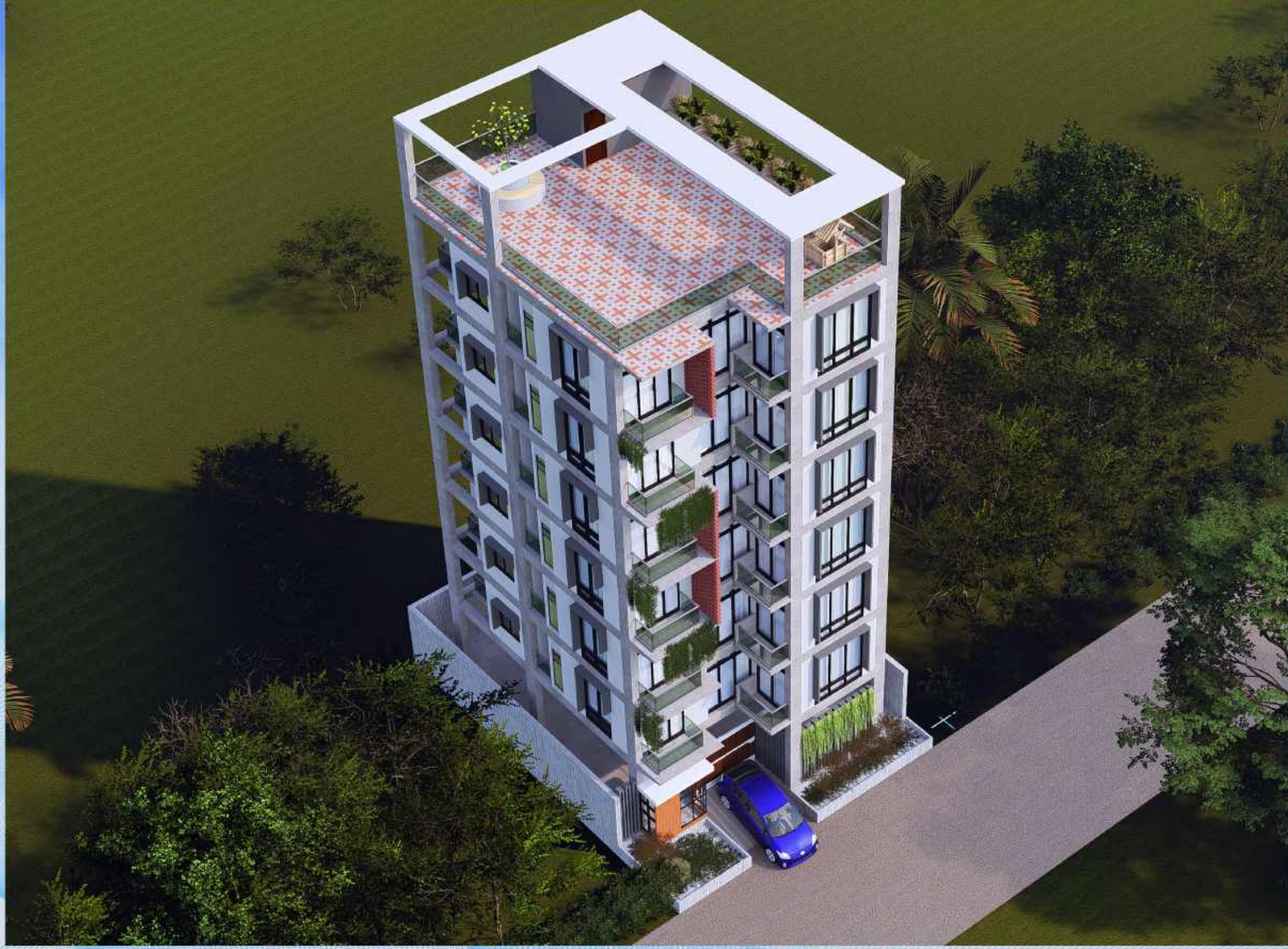
Perspective View of ANZ Florence Villa