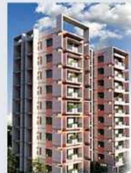
ANZ- Lake View at Bashundhara