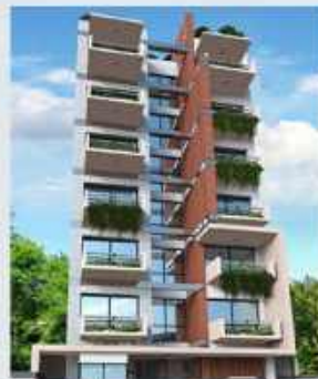
ANZ-Farazi Villa at Aftabnagar