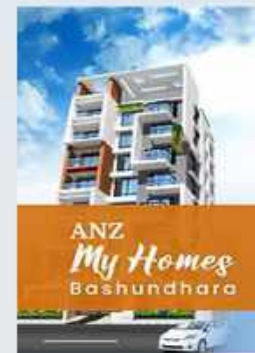
ANZ-My Home at Basundhara