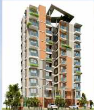
ANZ - Shouhardo at Bashundhara