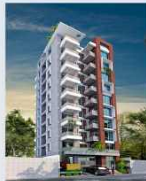
ANZ-Riverview at Bashundhara