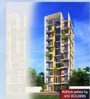
ANZ - Mahbub Palace at Bashundhara Riverview