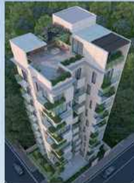
ANZ-Amity Villa at Bashundhara