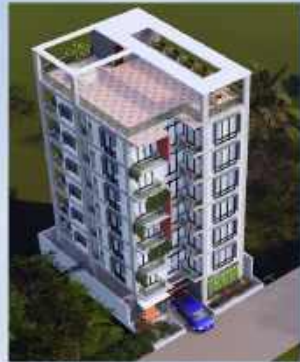
ANZ - Florence Villa at Bashundhara