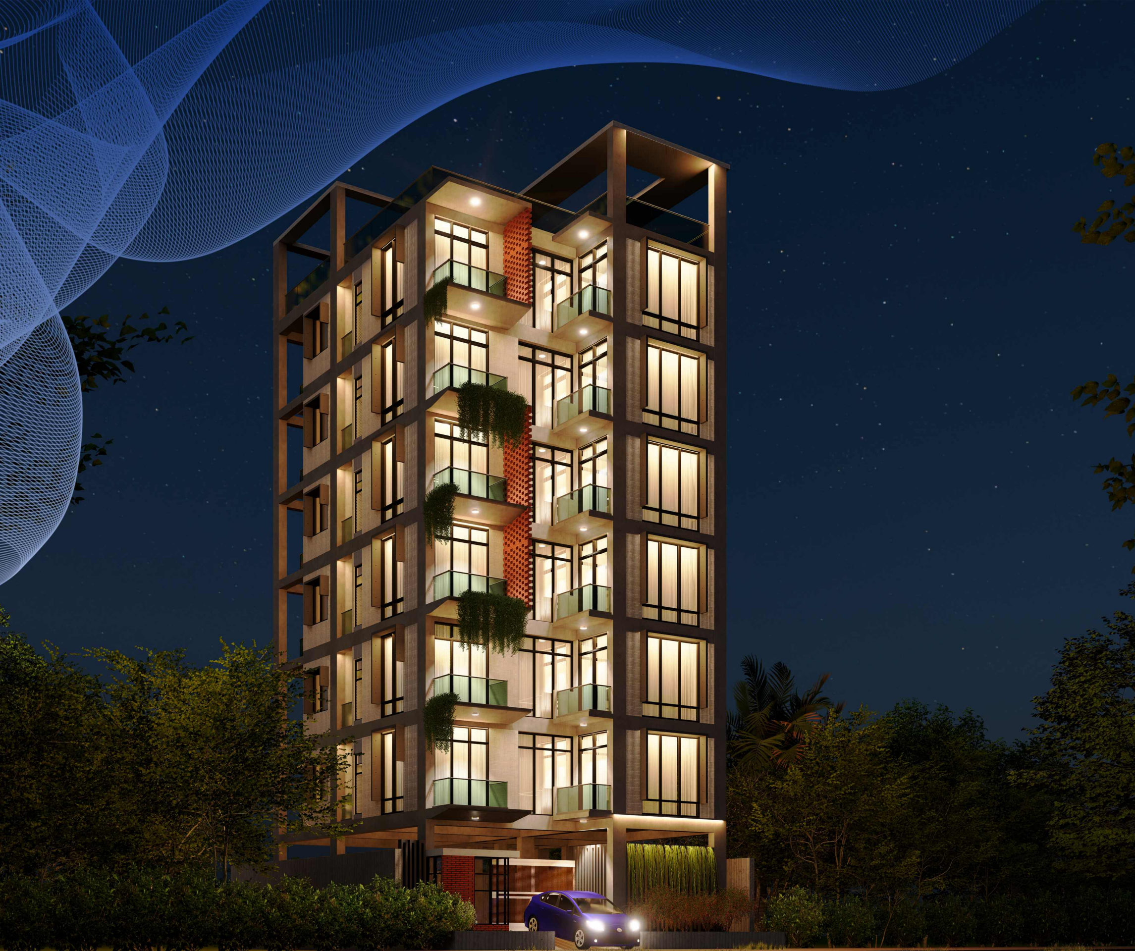
Night view of ANZ Florence Villa