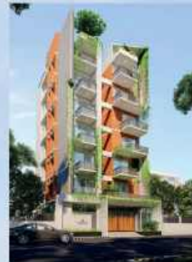
ANZ - Cherry Blossom at Bashundhara